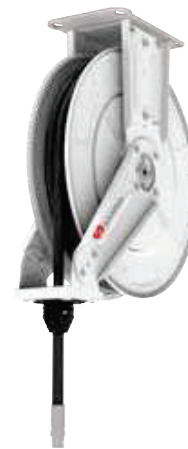
Reel with arms in ceiling mounting position.

Bare reels include hose stopper, swivel and connection adaptors.