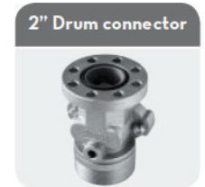
2" Drum connector