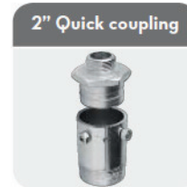
2" Quick coupling